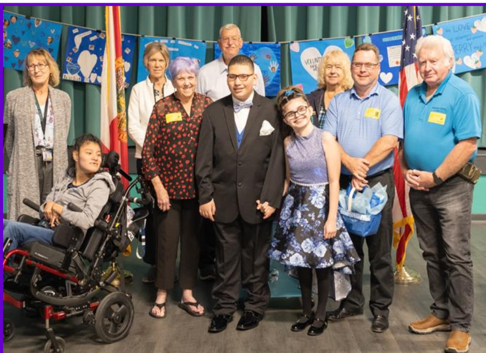
Bethlehem was recognized by the Buckingham Exceptional School for our continuing support with our annual holiday food basket efforts. Pictured are Pastor and members of the congregation with school staff and students at the Volunteer Recognition luncheon on February 14th

Daylight Savings begins Sunday March 10. Remember to turn your clocks ahead Saturday night so your not late for church Sunday.