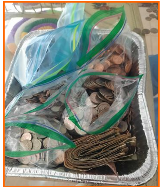
LWML's "noisy offering" on Feb. 25th raised $450 for their missions