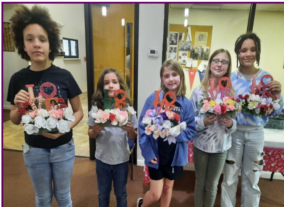
Youth group with Love arrangements made at the January meeting